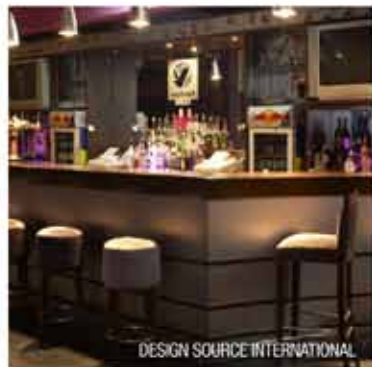
DESIGN SOURCE INTERNATIONAL