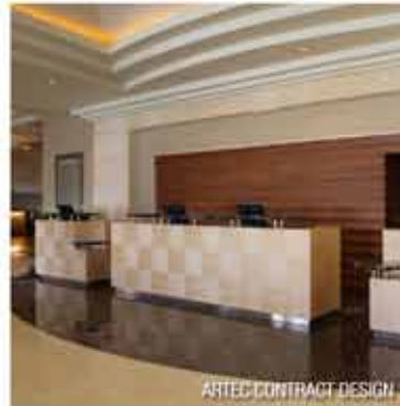
ARTEC CONTRACT DESIGN