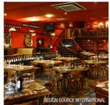
DESIGN SOURCE INTERNATIONAL