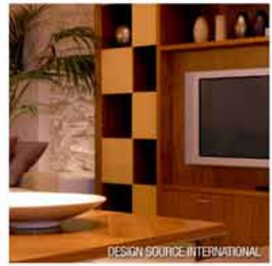
DESIGN SOURCE INTERNATIONAL

S.A.W. Ltd. is an innovative, client-driven, service-oriented company that takes pride in aiding customers on projects of any size.