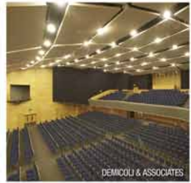
DEMICOLO & ASSOCIATES